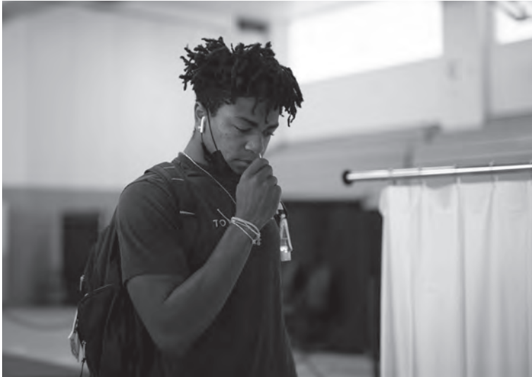
Advance-Titan File Folder