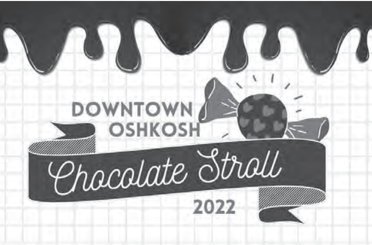
Downtown Oshkosh will host first ever Chocolate Stroll this Saturday. If you wanted to go it is too late as the event is sold out.