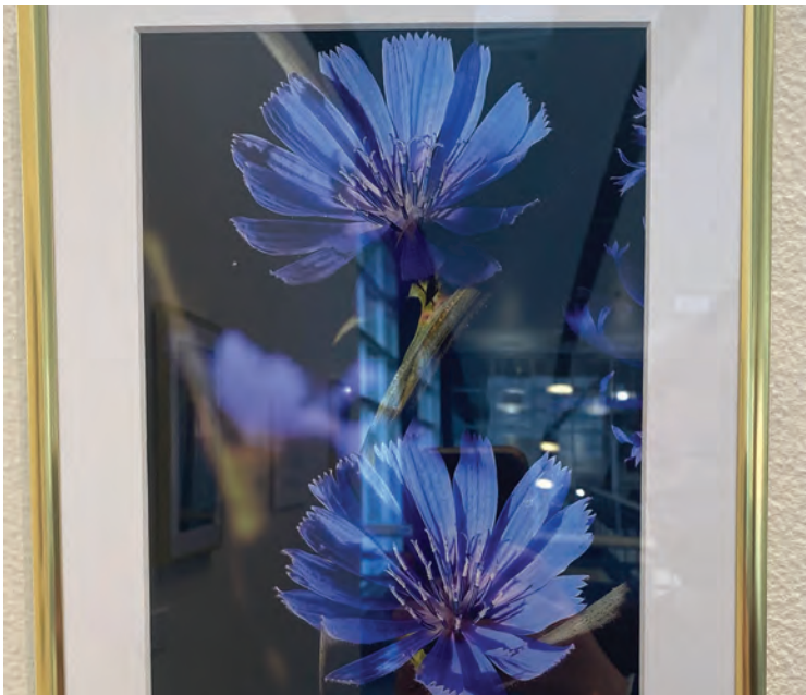
“Chicory” is one of many photos from the exhibit in Reeve Union.