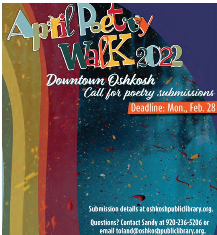
Oshkosh Public Library

The Oshkosh Public Library is asking for people to submit their poetry to be displayed on Main Street storefronts.