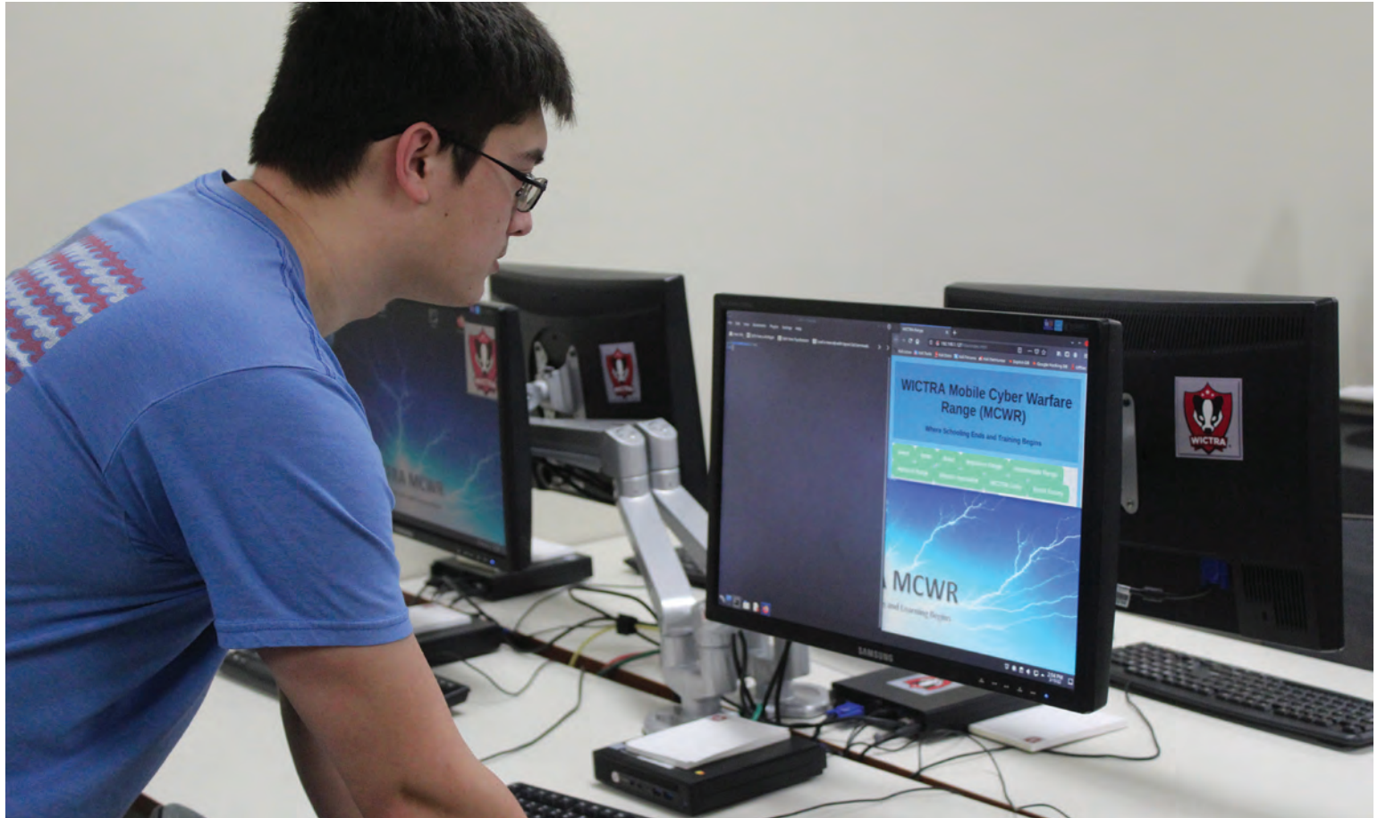
Kyra Slakes / Advance-Titan

The Advance-Titan is committed to correcting errors of fact that appear in print or online. Messages regarding errors can be emailed to atitan@uwosh.edu.