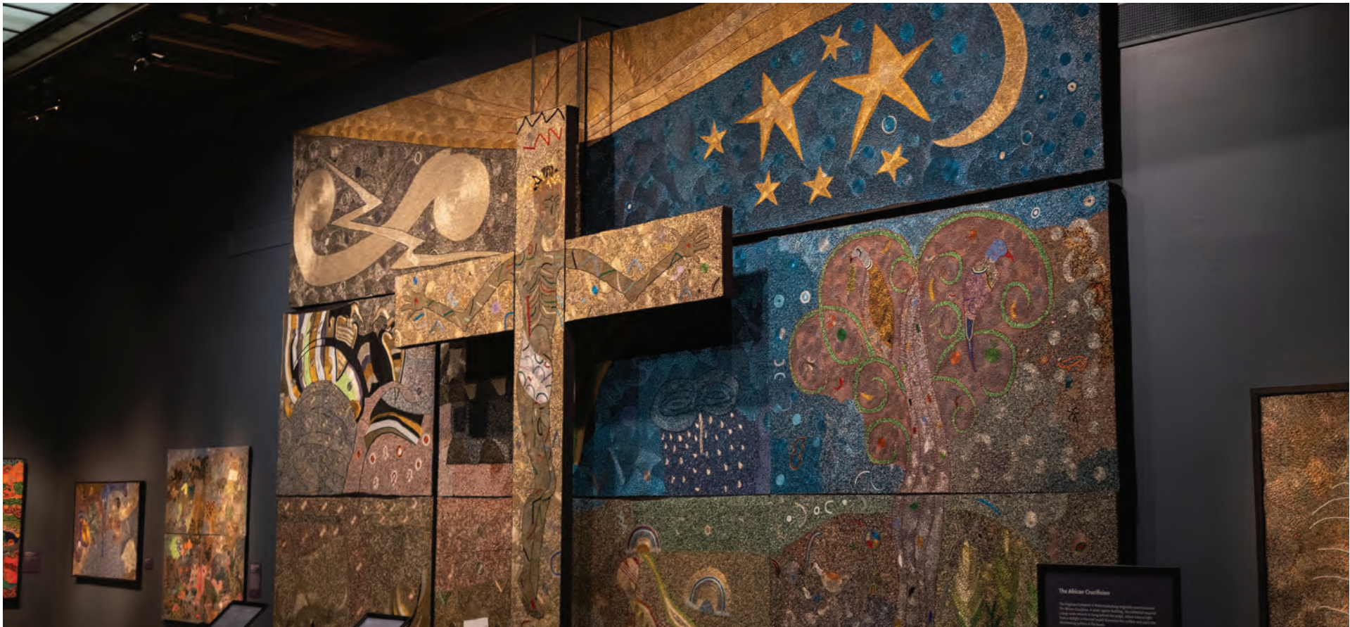
Liam Beran / Advance-Titan

The Beadwork exhibit opens March 3. This is the largest piece in the beadwork exhibit, entitled The African Crucifixion, it was created by seven Ubuhle Women artists.