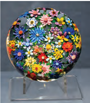
A glass paperweight on display at the Paperweights in Bloom exhibit.

site. Often depicted in the ndwangos are various motifs and symbols meant to represent the lives of the Ubuhle women. Many of the pieces depict bulls, a symbol of wealth in Xhosa and Zulu culture, or trees, which Ntobela utilizes to depict spiritual connections to ancestors, as well as the living world. Many ndwangos also serve as memorial pieces meant to honor Ubuhle women who have died, particularly from HIV/AIDS. “Some of the panels are tributes to Ubuhle women, or relatives who have passed away, many from HIV/AIDS and it shows how art can be a powerful tool, almost a form of therapy for many of the artists as they work through their memories and their feelings of loss,” Fiser said. Fiser said the artwork of the Ubuhle women offers compelling life stories, in addition to intricate, grand displays of beadwork. “It’s great to be able to look beyond just the intricacy of the beads and the beautiful bold patterns and colors to realize that there is a more significant, meaningful story that the artists are sharing, right alongside the beautiful beads and shimmering