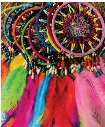
Colorful dreamcatchers are just some of the items featured throughout the store.

ry inspires them to “Listen to the wise, find your way out of the maze, soar to new heights, live on the edge and don’t be afraid to take a few chances.” The store has continued to adapt with the times and brings that peace and