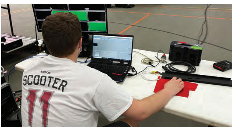
Cory Sparks / Advance-Titan

While Student Press Freedom Day is only celebrated once a year, the lessons it teaches must be remembered every day in order to protect students' First Amendment rights. Student journalism represents an amazing opportunity for young journalists to form critical thinking and questioning skills while simultaneously providing vital information and perspective to the public, and deserve freedom from censorship when doing this.