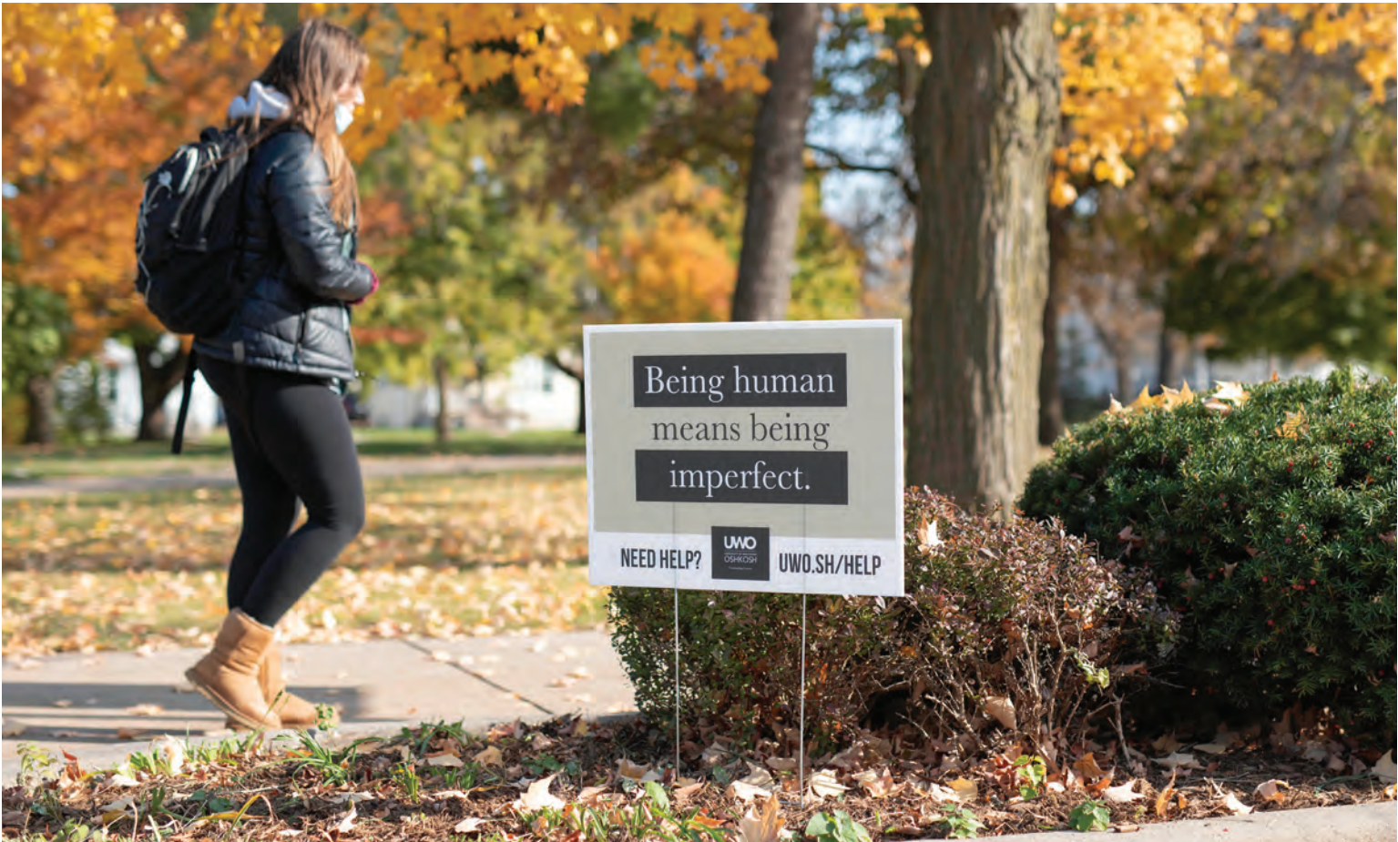
Kyra Slakes / Advance-Titan

There are times when people feel like they are lost in a hopeless situation or feel like they are drowning. To them, ending everything seems like the only way out. So if someone reaches out to you and says they want to hurt themselves or worse, take them seriously. Don't call them dramatic or an attention seeker or tell them to get over it because doing that will only push them closer to the