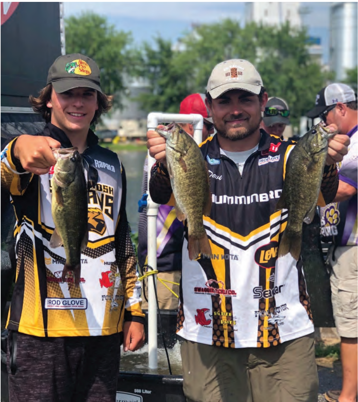
The UW Oshkosh Fishing Team regularly attends competitions, outings and also hosts seminars.