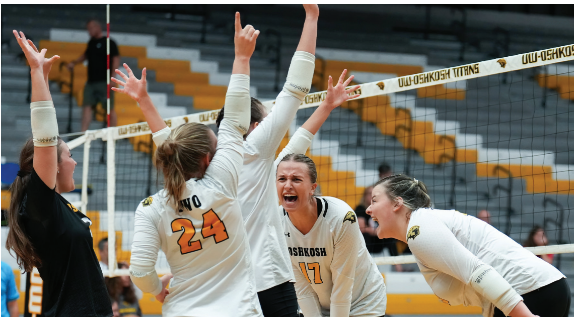
The Titan volleyball team celebrates after a point against MSOE Sept. 9 at the Kolf Sports Center.

UWO, staying at No. 3 in this week's American Coaches Volleyball Association poll swept the No. 7 ranked Warhawks with