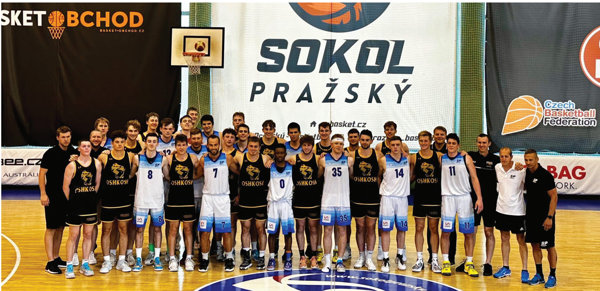
The UWO men’s basketball team poses with Czech basketball team Sokol Prazsky after an exhibition game between the two teams over the summer in Prague.