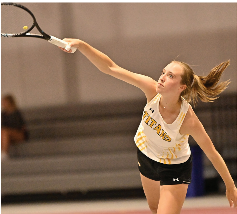
The Titans fell to UW-La Crosse on the road 9-0 Sept. 16.

Titans return home against St. Norbert College Sept. 23. UWO is 26-8 against the Green Knights since their first meeting in 1985.